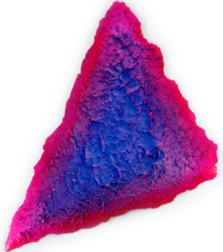
CHARGE Δ9278 - ACRYLIC, WOOD - 109 x 90 x 80 cm - 2017