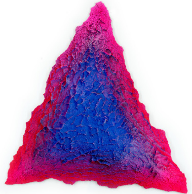
CHARGE Δ8641 - ACRYLIC, WOOD -94 x 90 x 80 cm - 2017