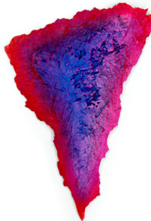
CHARGE Δ1855 - ACRYLIC, WOOD - 77 x 66 x 50 cm - 2017