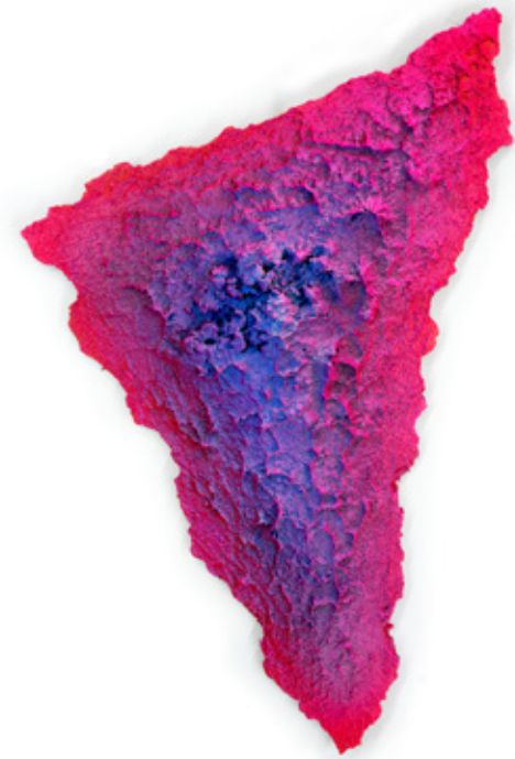
CHARGE Δ2691 - ACRYLIC, WOOD -65 x 54 x 42 cm - 2017