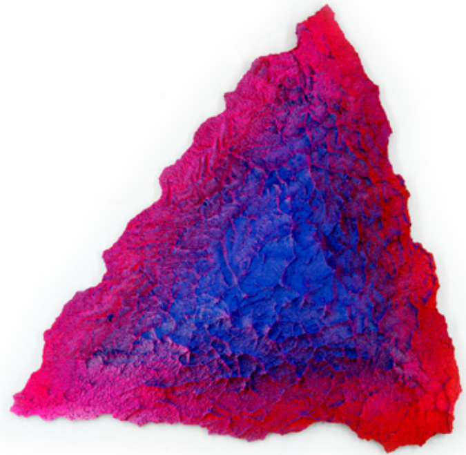
CHARGE Δ7424 - ACRYLIC, WOOD - 90 x 77 x 76 cm - 2017