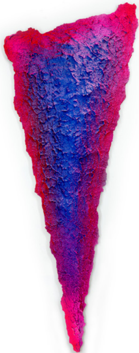
CHARGE Δ5598 - ACRYLIC, WOOD - 130 x 119 x 50 cm - 2017