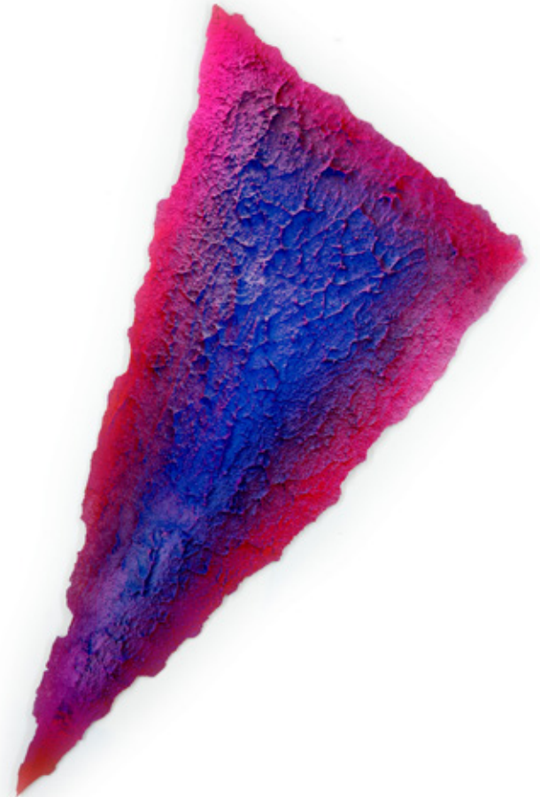
CHARGE Δ4217 - ACRYLIC, WOOD - 100 x 111 x 54 cm - 2017